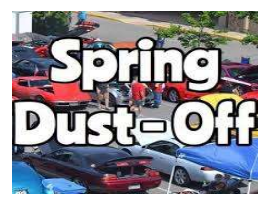
Dust Off Vietnam Memorial Wall/Lunch